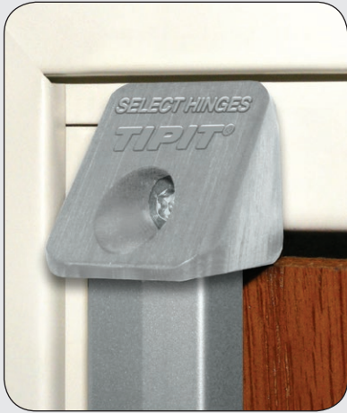
Gray TIPIT® on clear anodized concealed hinge. Specify [TIPIT CG].

Make rooms safer and meet legal requirements by retrofitting doors with the patented SELECT TIPIT® hospital tip. The tip deters patients or inmates from harming themselves by hanging objects from the hinge.