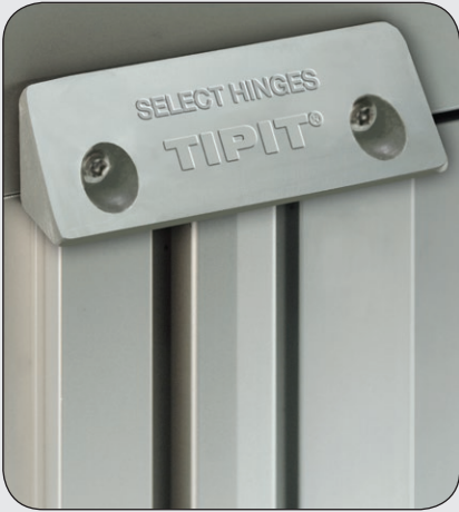
Gray TIPIT® on clear anodized full surface hinge. Specify [TIPIT LG].