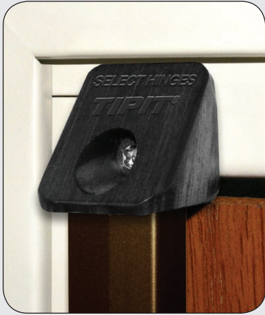
Black TIPIT® on dark bronze anodized concealed hinge. Specify [TIPIT CB].