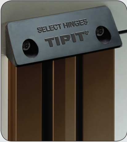
Black TIPIT® on dark bronze anodized full surface hinge. Specify [TIPIT LB].

FOR USE IN HOSPITALS, CORRECTIONAL FACILITIES, SCHOOLS AND OTHER INSTITUTIONS