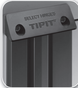
Dark bronze anodized full surface hinge with black TIPIT