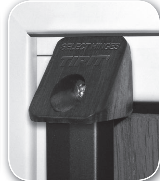
Dark bronze anodized concealed hinge with black TIPIT