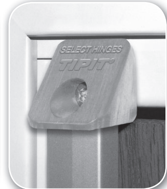
Clear anodized concealed hinge with gray TIPIT