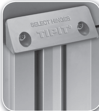
Clear anodized full surface hinge with gray TIPIT