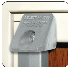
TIPIT available in two sizes, in black or gray.