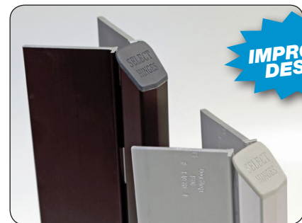
Hospital tip end caps available in black or gray.

Find more hospital tip information and specs at selecthinges.com/select-hospital-tips .